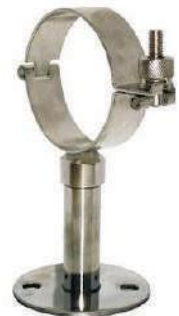
Dairy Clamp with Stand NFI-036