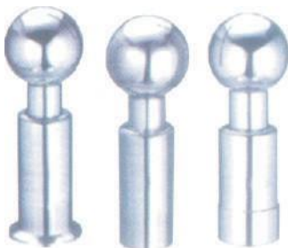
SMS/TC Cleaning Ball NFI-070