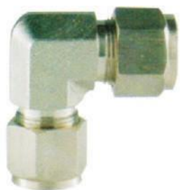
Union Elbow OD NFI-112