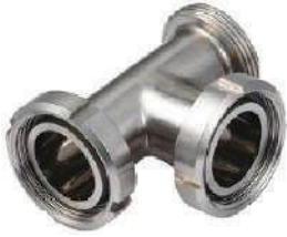
SMS Tee NFI-061