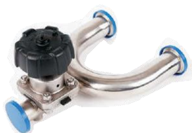
U Type Diaphragm Valve NFI-023