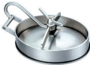
Man Hole NFI-082