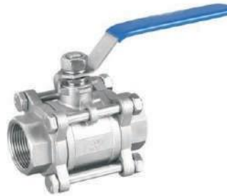
Three PC Ball Valve NFI-092