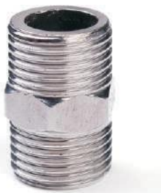
Hex Nipple NFI-127