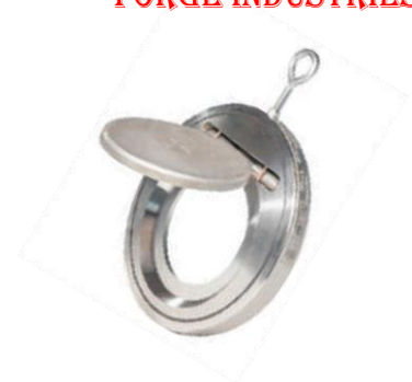
Wafer Check Valve NFI-099