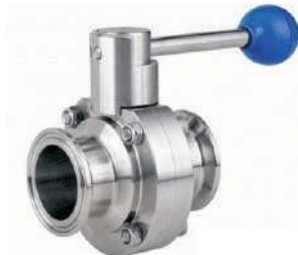
TC Butterfly Valve NFI-008