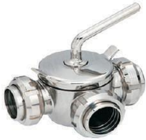
Three Way Valve (SMS) NFI-001