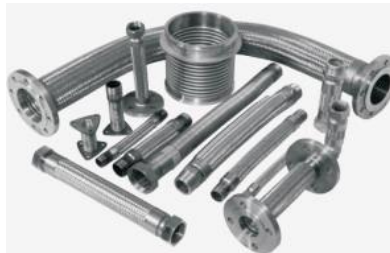
Flexible Hose Pipe NFI-140