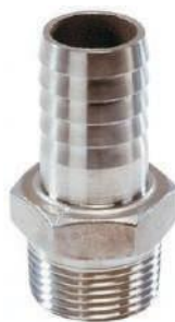
IC Hose NFI-128