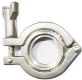
TC Clamp Indian Set NFI-031