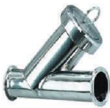
TC Stainer NFI-103