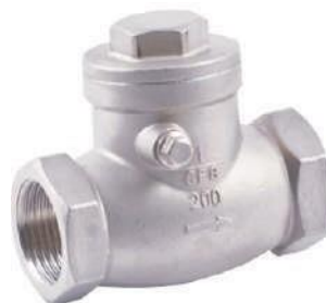
NRV Horizontal NFI-095