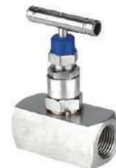
Needle Valve up To 5000 PSI NFI-153