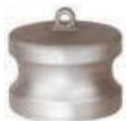
Type DP NFI-152