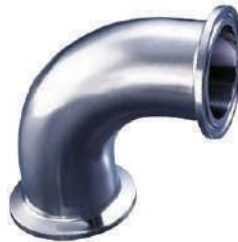
TC Bend 90° NFI-044