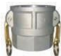
Type D NFI-148