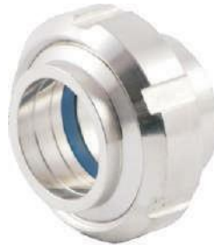
SMS Union NFI-056