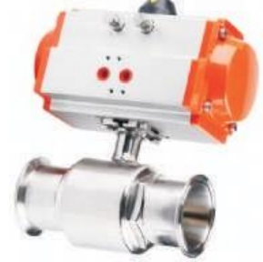
Actuator with TC End NFI-075