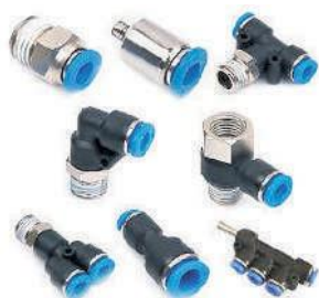
PU Connector NFI-118