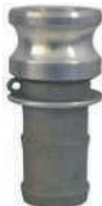
Type E NFI-149