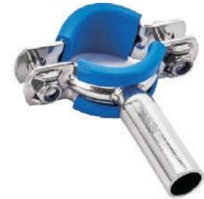
Dairy Clamp with Rubber NFI-033