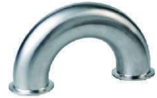
TC U Bend NFI-051