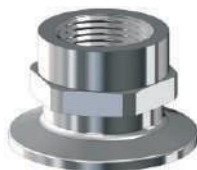
Female TC Liner NFI-155