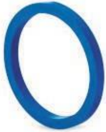
Union Ring NFI-037