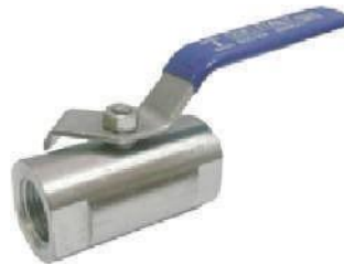
BSP Ball Valve Bar Stock NFI-101