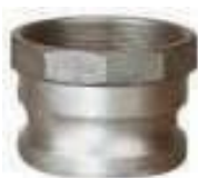
Type A NFI-145