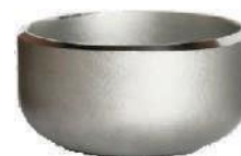
End Cap NFI-132