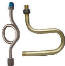
Tube Q & U NFI-106