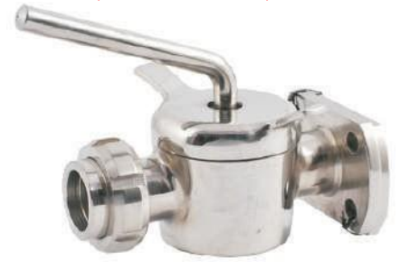
Tanker Valve NFI-003