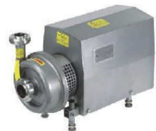
Centrifugal Milk Pump NFI-144