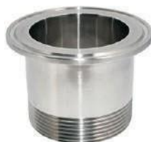
Male TC Liner NFI-154