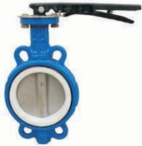
Butterfly Valve CI NFI-100