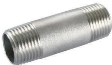
Barrel Nipple NFI-130