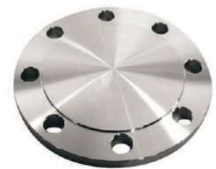
Blind Flange NFI-138