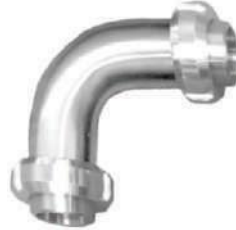
SMS Bend NFI-062