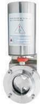
Pneumatic Valve Weldable NFI-074