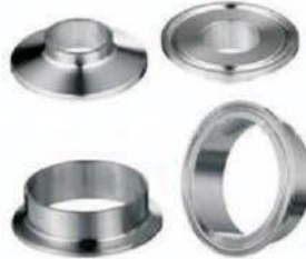
TC Ferrule NFI-029