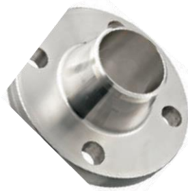
Weld Neck Flange NFI-137