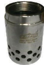
Foot Valve NFI-141