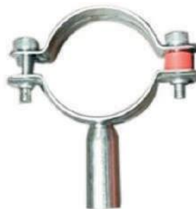
Dairy Pipe Holder Imported NFI-035