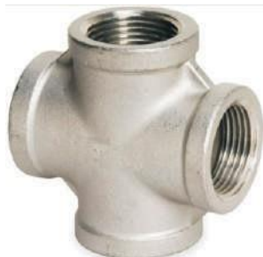
CKMiss Tee NFI-124