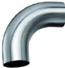
90° Bend Plain NFI-041