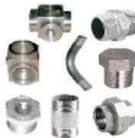
Bar Stock Fittings NFI-143