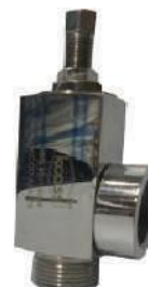
Safety Valve Angle Type NFI-156