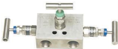
Three Way Manifold NFI-115