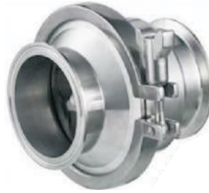
NRV Welded NFI-014