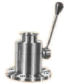
TC Flush Bottom Valve Ball Type NFI-021