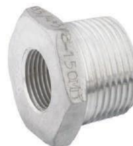
Male Female Bush NFI-126