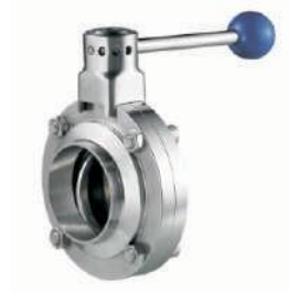
Butterfly Valve Welded NFI-005