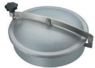
Man Hole NFI-081