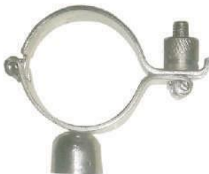
Dairy Pipe Holder NFI-034