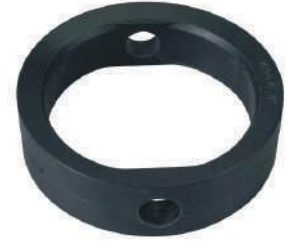
Butterfly Gasket NFI-039