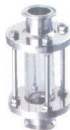
TC SIGHT GLASS NFI-011