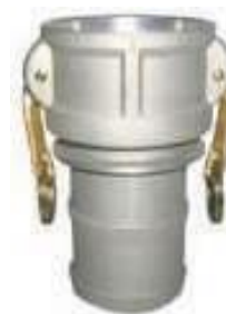
Type C NFI-147