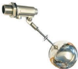
Float Valve Imported NFI-022