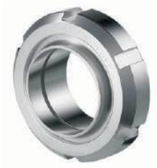
Welded Union NFI-055