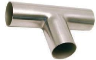
Tee Plain NFI-042