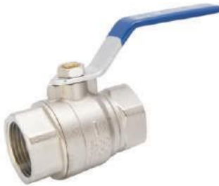
2 PC Ball Valve NFI-091