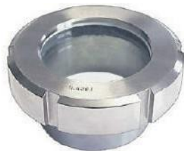
Side View Glass NFI-058