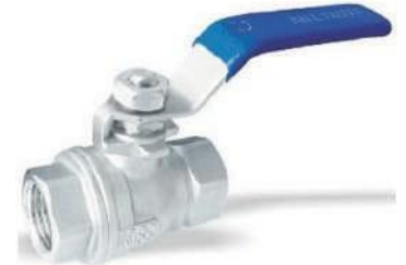
Ball Valve NFI-087