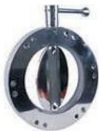
Butterfly Valve Sandwich Type NFI-010