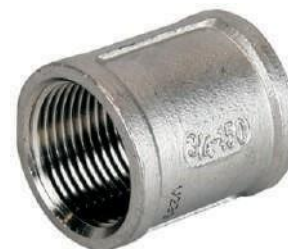
IC Coupling NFI-129