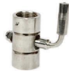
Syphone Cock NFI-105