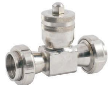
Micro Valve with Union NFI-024