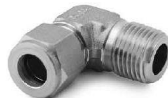
Male Elbow NFI-111