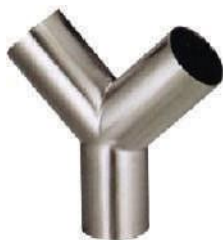
Y Bend Plain NFI-046