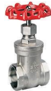
Gate Valve NFI-090