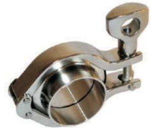
TC Clamp Full Set NFI-030