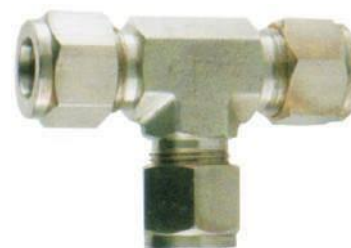
Union Tee OD NFI-114