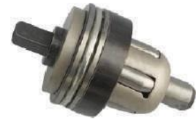
Tube Expander NFI-102