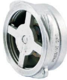
Disk Check Valve NFI-098