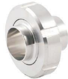
DIN Union NFI-057