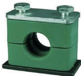
PP Clamp NFI-119