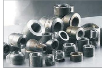
SCREWED & FORGED FITTINGS

Types : Bolts, Nuts, Washers, Anchor Fasteners, Stud Bolts, Eye Bolt, Stud, Threaded Rod, Cotter Pin, Socket Screw, Fine Fasteners & Spares, Foundation Fasteners, etc.