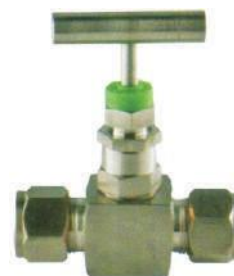
Ferrule Needle Valve NFI-117