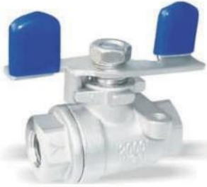
Butterfly Handle Ball Valve NFI-085