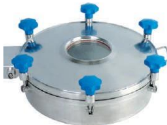
Man Hole NFI-083