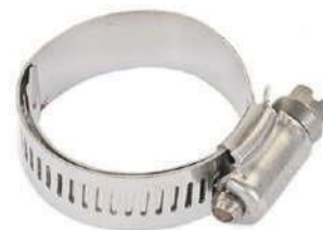
Hose Clip NFI-120