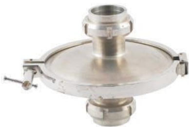
Disk Filter with Union NFI-016