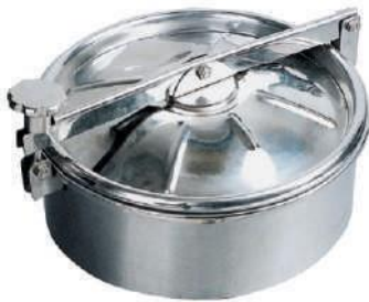
Man Hole NFI-079