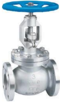
Globe Valve NFI-097