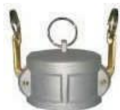
Type DC NFI-151