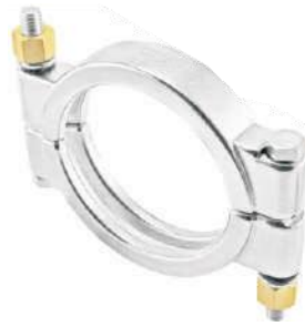
High Pressure Clamp NFI-026