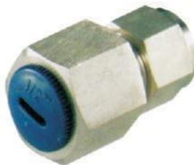
Female Connector OD NFI-113