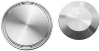
Ferrule Blind NFI-028