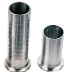
TC Hose Nipple NFI-108