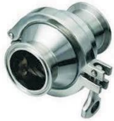
TC End NRV NFI-013