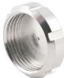
Blind Nut NFI-059