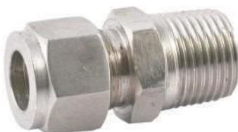
Male Connector NFI-110