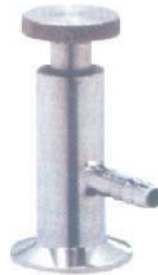
TC Sampling Cock NFI-065