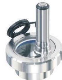
Side View Glass with Wiper NFI-060