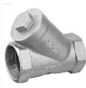
Y-Type Strainer NFI-094