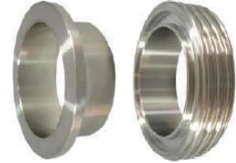
SMS Liner / Male Part NFI-063