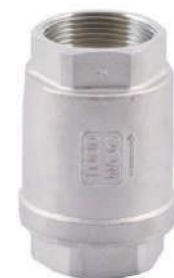
NRV Vertical NFI-096