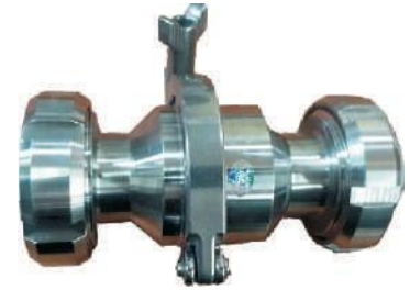
NRV with Union (SMS) NFI-015