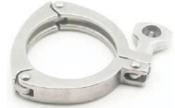
3 Pin Clamp NFI-027