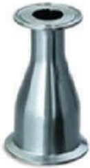
TC Reducer NFI-052