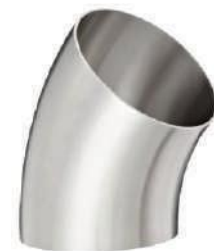
45° Bend Plain NFI-048