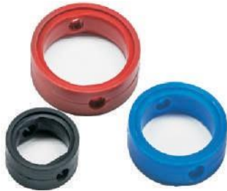
Gasket Kit NFI-040