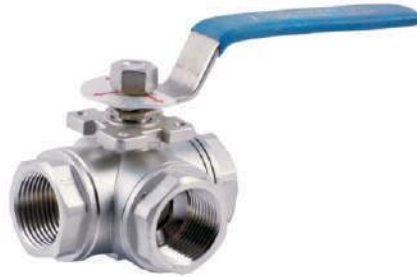
Three Way Valve NFI-086