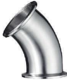
TC 45° Bend NFI-050