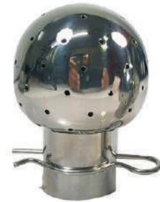
Pin Type Spray Ball NFI-069