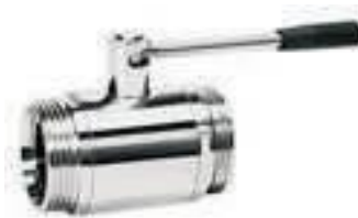
SMS BALL VALVE NFI-020