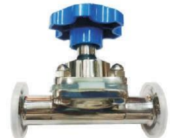
Diaphragm valve NFI-006