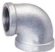
Reducing Elbow NFI-121