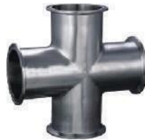
TC CKMiss NFI-053