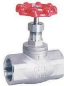
Globe Valve NFI-089