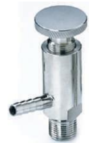
Sampling Valve NFI-066