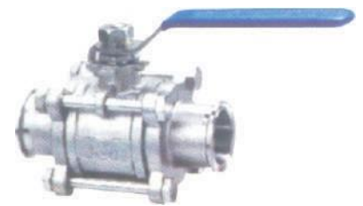
3 PCT.C. Ball Valve NFI-093