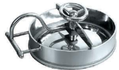
Man Hole NFI-084