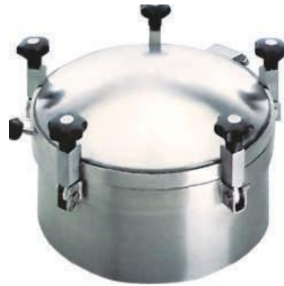
Man Hole NFI-080