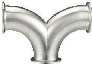
TC Y-Bend NFI-049