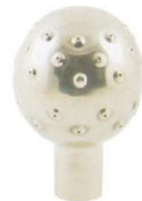
Indian Spray Ball Fix NFI-072