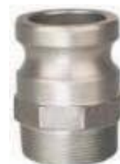
Type F NFI-150