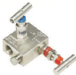
Two Way Manifold NFI-116