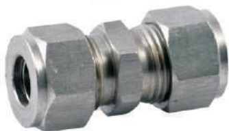
Union OD NFI-109