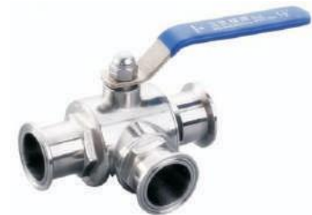
TC Ball Valve 3 Way NFI-009