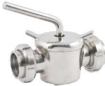
Two Way Valve (SMS) NFI-002