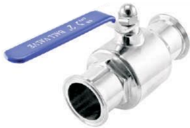
TC End Ball Valve NFI-007