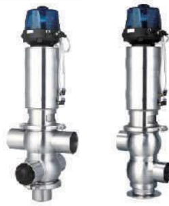
Mixing Proof Valve NFI-077