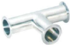
TC Tee NFI-043