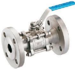
Flange Type Ball Valve NFI-088