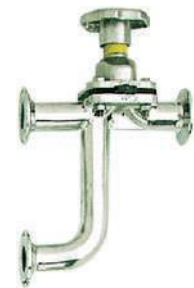
Zero DEAD VALVE NFI-018