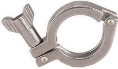
TC Clamp NFI-025