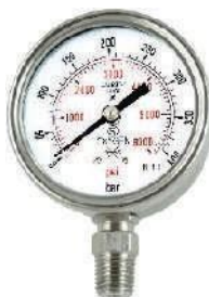
Pressure Gauge NFI-107