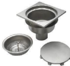
Floor Drains NFI-104