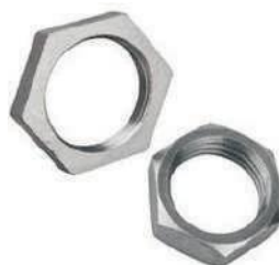
Check Nut NFI-131