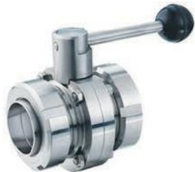
Butterfly Valve with Union NFI-004