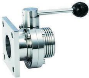
Tanker Valve with SMS Union NFI-019