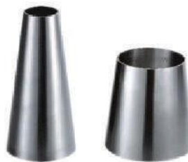
Con Reducer NFI-047