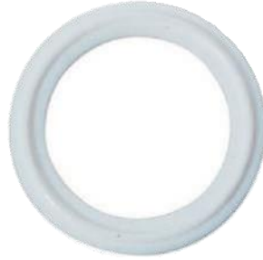
TC Gasket NFI-038