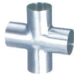
Cross Tee Plain NFI-045