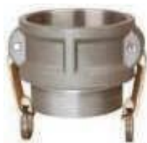
Type B NFI-146